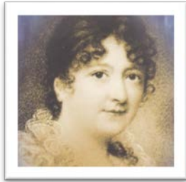
MARY AIKENHEAD (AGED 20)

Since 1838, the Sisters of Charity of Australia have made a profound contribution to the education, wellbeing and social fabric of Australian society through health care, aged care, social services and education.